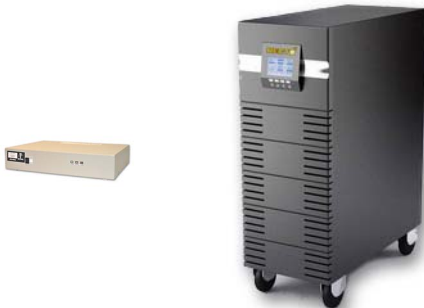
FIGURE 1. Left, ATS-1000E-30A (19" rackmountable, height: 2U, and weight is about 7 kg) FIGURE 2. Right, 10 kVA online UPS system (typical standalone cabinet, weight is about 150 kg with a 8–10 minutes battery bank)